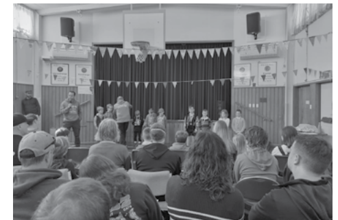
Every year, the club celebrates all of its people.