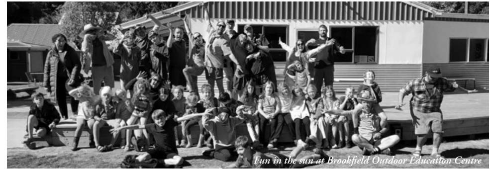
Fun in the sun at Brookfield Outdoor Education Centre