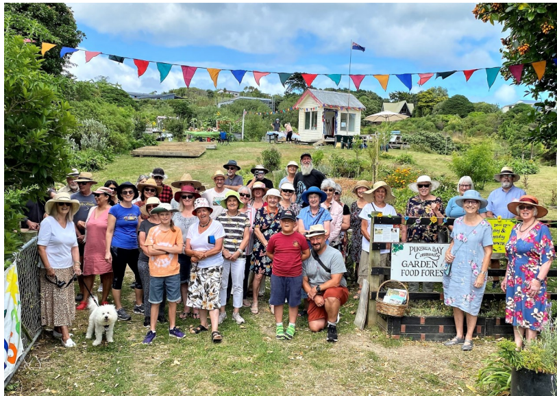
Garden Party 24 January 2023