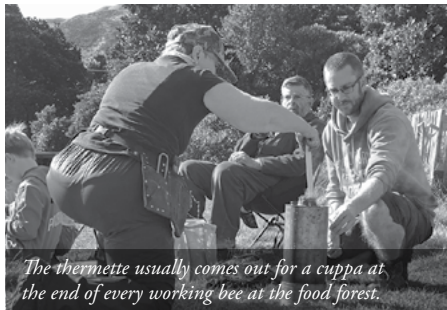
The thermette usually comes out for a cuppa at the end of every working bee at the food forest.

The Pukerua Bay Community Garden and Food Forest is really starting to take shape now, and is in its third year of growth. There is a keen group of people who meet regularly to tend the plants, clear weeds, and develop new areas.