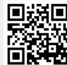
Survey QR code