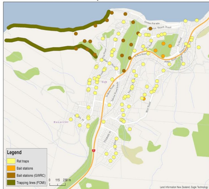
Predator Free Pukerua Bay trap coverage as of 1 April 2017.

To protect your privacy, we have placed a trap location marker near participating properties rather than exactly on it. Check out what's going on near you.